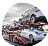
Car carrier trailers